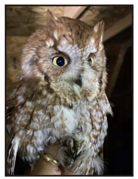
Eastern Screech Owl