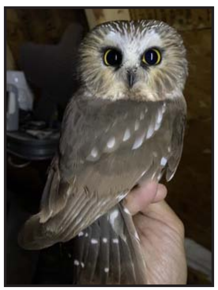
NSWO #400, captured October 16, 2020