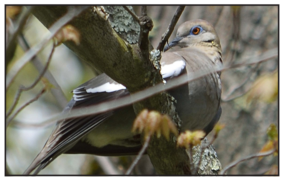
Figure 3. White-winged Dove.