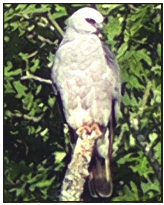
Figure 4. Mississippi Kite video.