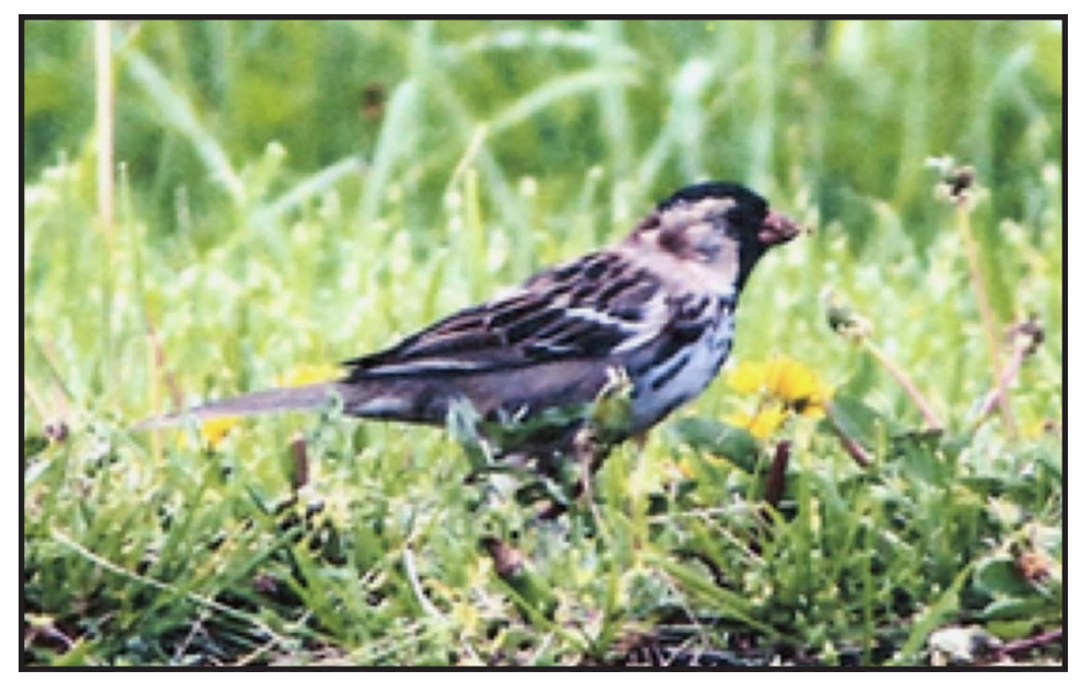
Figure 2. Harris's Sparrow.