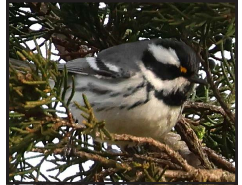
Mega-rare Black-throated Gray Warbler, found December 17, 2024, Grant Co., WV.

When the weather gets cold outside, the mice move into our basement. We don't pay much attention to them. This winter, with heavy rains & snow melt our basement has been flooding. The basement mice have decided it is more comfortable to climb the