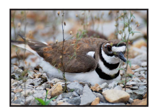
Female Killdeer on her nest

We spent Tuesday through Thursday camping at the beautiful, secluded Holly River State Park. During the two days, we heard Wood Thrushes almost everywhere we went. They were the first bird I heard when awakening in the morning and almost the last in the evening. They seemed to sing most of the day. Veeries were also present down at the campground as were Acadian Flycatchers and both Blue-headed and Red-eyed Vireos.