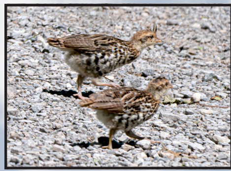
Ruffed Grouse chicks - Jim Triplett

We had a total of 96 bird species for the day. Some of them were Osprey, Sharp-shinned and Cooper's Hawks, Yellow-billed Cuckoo, Eastern Whip-poorwill, Eastern Kingbird, Hermit Thrush, Louisiana Waterthrush and Rose-breasted Grosbeak.