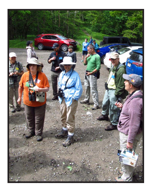
Everyone was enjoying the perfect weather, great birds and wonderful company up on Bickle Knob at the 2019 Foray.