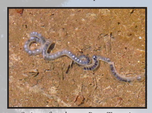
Strings of toad eggs - Ryan Tomazin

Some of the interesting trees were Mountain Maple with its upright flowers, Striped Maple with its huge, soft leaves and Fraser Magnolia with its distinctive leaves with earlobes at the base. Poke Milkweed was also pointed out.