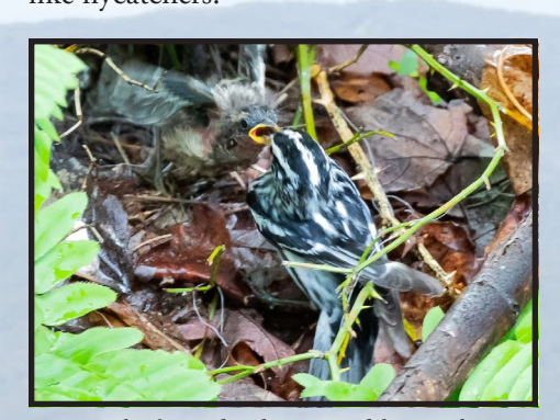
Black-and-white Warbler with cowbird chick - Jim Triplett

Instead of returning to camp, I decided to drive to the Spillway Bridge on Georgetown Road near Elkins where a Pied-billed Grebe had been seen earlier. This bird was consider to be quite the anomaly for this time of year. The rain had let up and Tree Swallows, Northern Rough-winged Swallows and Cliff Swallows were flying all around, but no grebe was to be seen. A female Wood Duck was spotted way off in the distance and Cedar Waxwings, which seemed to be everywhere we went, were catching insects like flycatchers.