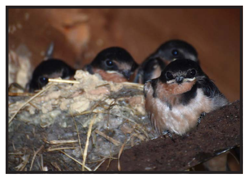
A baby Barn Swallow, about to fledge