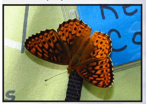
Aphrodite Fritillary - Ryan Tomazin

At 5 a.m. the next morning, folks gathered to depart to two twenty-stop breeding bird surveys and one singing male census survey plot. An overcast, warm, windy day.