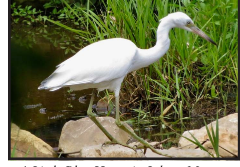
A Little Blue Heron in July at Marmot Locks & Dam

This morning during a fairly quiet walk through White Park in Monongalia County, I was shocked to hear the piercing song of a Swainson's Warbler rise up from the understory. I didn't believe it until I was able to watch the bird as it sang its heart out for several minutes. It was in a small gully that runs into the reservoir not far from the parking area along Mississippi St. The last eBird record for SWWA in Mon county was in 2010, and before that it