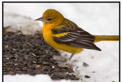
A Baltimore Oriole on the wrong side of the calendar

Our sojourn into the freezing weather wasn't bad either. Among the highlights was at least 45 Bald Eagles, 3 Golden Eagles, a raft of 45 plus Mallards, Great Blue Heron, a big