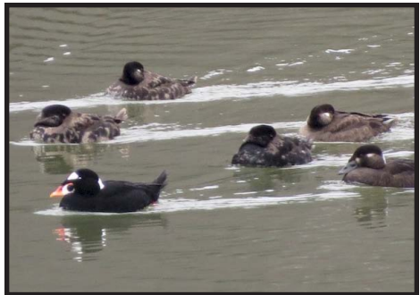
December Surf Scoters in Belle, WV

The first official bird walk for the PVAS's newly acquired 12-acre Cool Spring Preserve just south of Charles Town in Jefferson County took place this morning. It was a crisp start in the high 30's but what a great day it turned out to be. The warming of the morning sun gave us a tremendous flurry of bird activity. We were barely out of the parking lot when we had over 10 species of birds and it only got better. We saw a total of 33 species, including a large flock of Rusty Blackbirds; large flock of Cedar Waxwings that seemed to follow us on the trails for some great looks; both kinglets; Winter Wren; Song, White-crowned,