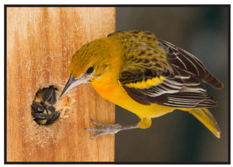
A Baltimore Oriole eating peanut butter and black sunflower seeds.