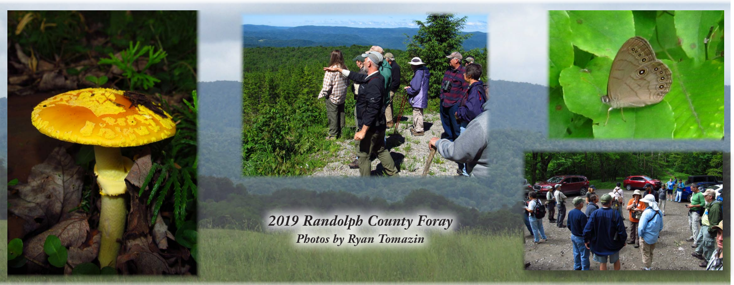
2019 Randolph County Foray Photos by Ryan Tomazin