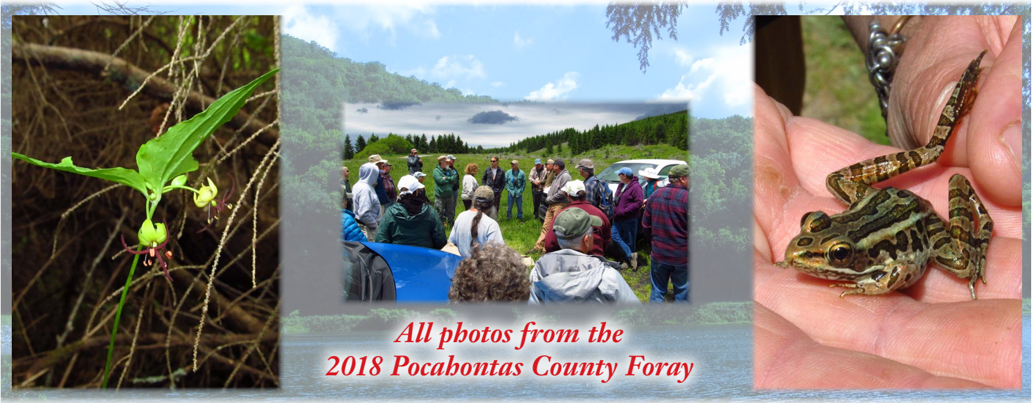
All photos from the 2018 Pocahontas County Foray