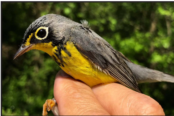
Canada Warbler