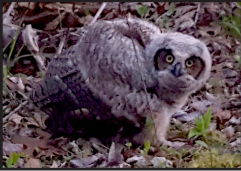
Baby Great Horned Owl

courtship feeding at South Mill Creek Lake Park, Grant County, on April 22.