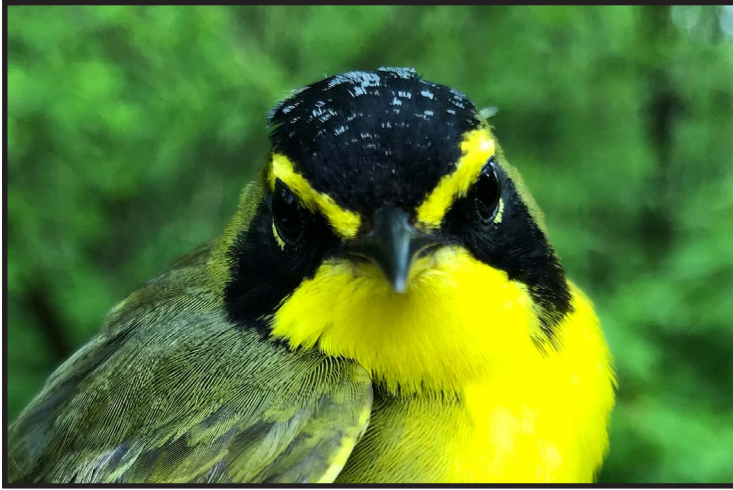
Kentucky Warbler