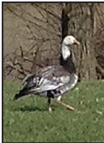
Blue-morph Snow Goose