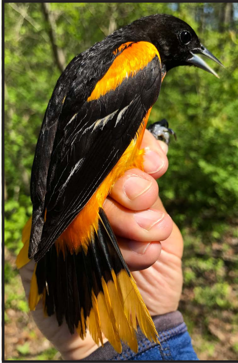
Baltimore Oriole