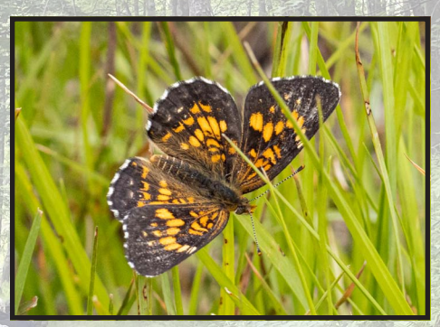
Harris' Checkerspot - Beall Tract

It was a cool and slightly overcast morning for the 6:30 AM bird walk. Tom Fox led the group down towards the open fields at the main camp then back up the path that followed the creek behind the campground. Dawn Fox spotted a small hanging, cup-like nest low in a small shrub along the path. It had two small white eggs inside, and soon an Indigo Bunting flew in to attend to the nest. As the group walked the path, a Louisiana Waterthrush seemed to escort them along the way. Two Parulas were also heard singing in opposition to one another.