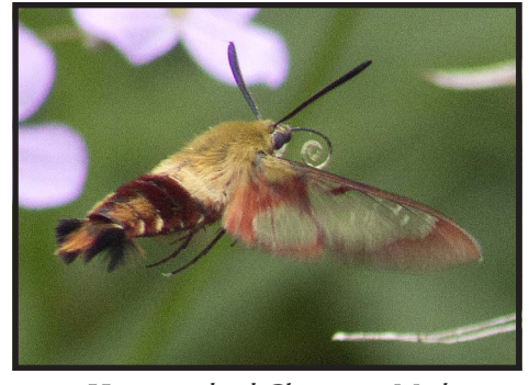
Hummingbird Clearwing Moth

You can access the fund page from the BBC Home page and the AFMO page, you can go to https://www.paypal.com/donate/?hosted_button_id=ZWS8C3AYQ4ZNC, or you can scan the QR code below to be taken to the Paypal page directly. Any donation is appreciated!