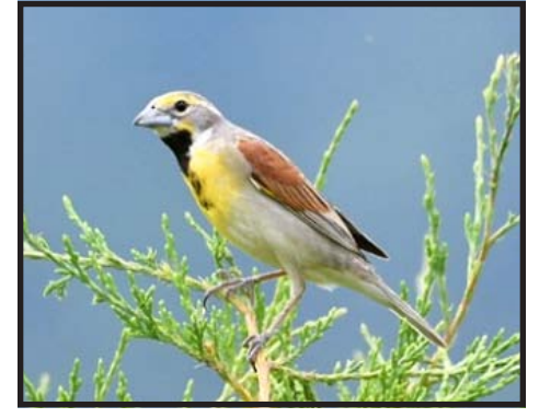
Dickcissel on Hogueland Lane, Grant County, WV