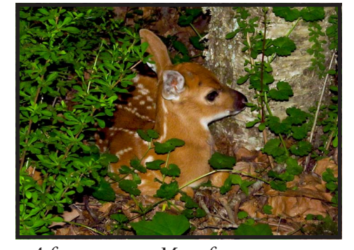
A fawn at camp. Many fawns were seen.