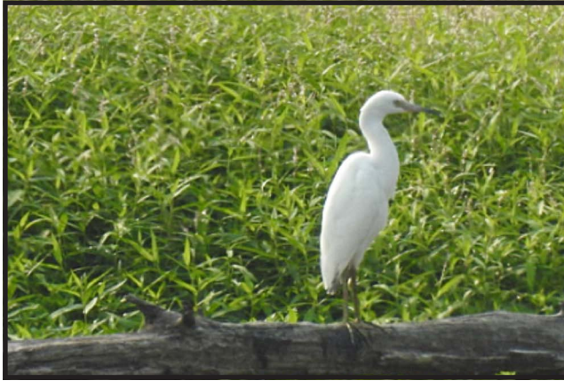
Little Blue Heron.

The summer of 2021 was an interesting birding season. Reports to eBird were plentiful, and there was a good variety of species reported, most of them resident or breeding birds, with a few surprising visitors mixed in with the expected species. Observations on eBird were filed for several noteworthy birds, some rare for the state, others uncommon if not actually rare, and at least two regularly occurring species that seem to be becoming established over the last several years in the state. Beginning with the rarest for the state, Roseate Spoonbills ( Platalea ajaja ) were found at South Mill Lake in Grant County. The five individuals were reported from June 24 to June 30 on 34 eBird lists, many with clear photographs included. This is only the second time the species has been recorded in the state on eBird, with the previous instance occurring in 2018 at Terra Alta Lake, also in June. It is too early to call this a trend, but there is a reasonable chance that these spectacular birds will become a bit more common in the area.