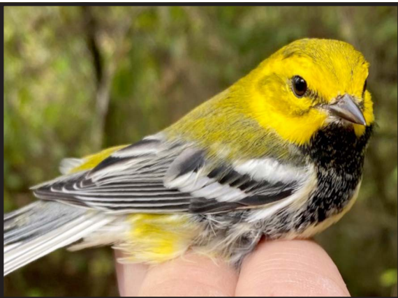
Black-throated Green Warbler