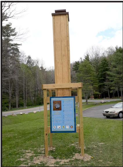
Little Beaver tower.