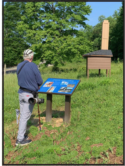
Tower at Forks of Coal.

The tower at the Forks of Coal State Natural Area was the second tower built through assistance of the Handlan Chapter of BBC. The tower was built with funds from the Handlan Chapter, BBC, and our Foundation. Construction and installation were done by the teachers and students of the Boone Career and Technical Center, our good neighbor and partner. Members of the Handlan Chapter were very helpful in consulting and installation. Volunteer board members of the Foundation helped with painting. The Foundation has placed an interpretive sign (see photo) about the chimney swifts and their need for more nesting sites. The Foundation appreciates the opportunity to collaborate with the Handlan Chapter of BBC on the tower and other bird-related projects.