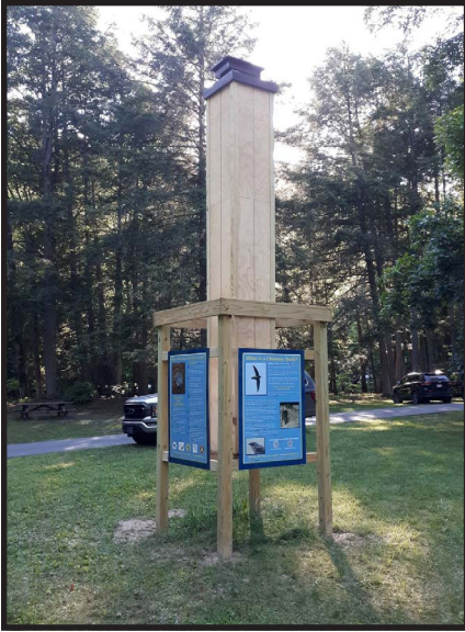
Camp Creek Tower.