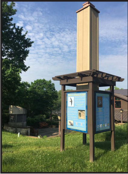
Tower at Wheeling.

To blend in, this tower's façade was designed to match the Schrader Center. Over the many days it took for me to erect and stain the Wheeling tower, there wasn't a passer-by that did not show interest in what was being constructed. Several of the regular walkers would stop by daily checking the progress, asking questions about swifts and other birds, and many shared their own stories of birds.