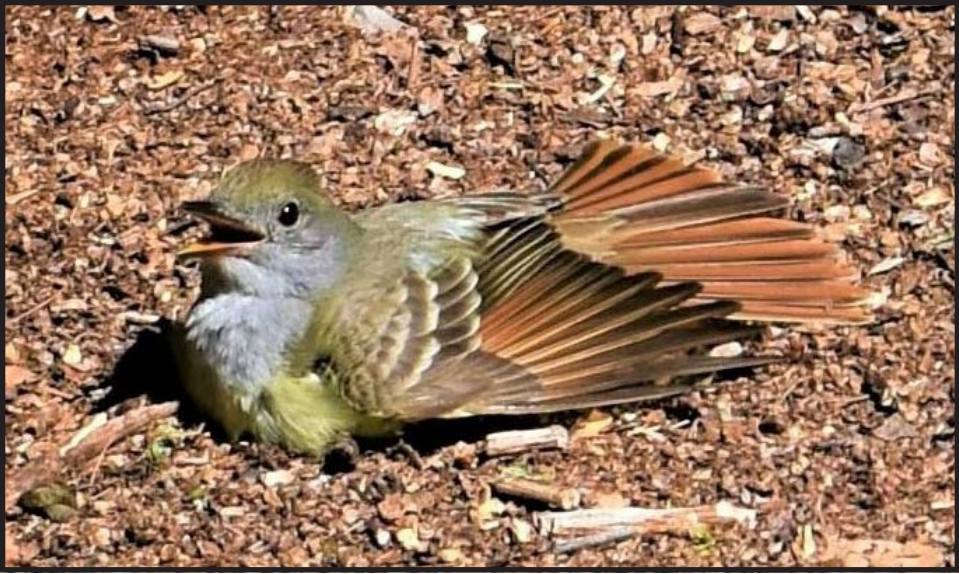
Great Crested Flycatcher at beginning of dance.