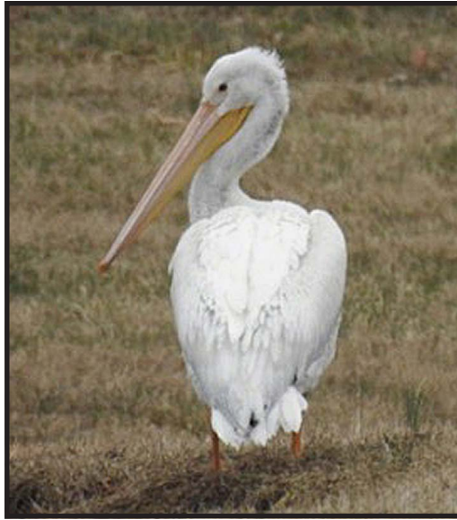
American White Pelican ( Pelecanus erythrorhynchos ), Pleasants County

According to the evidence from eBird reports, birding in West Virginia from December 1, 2018 to February 28, 2019, seemingly was impacted by the unusually warm and wet weather patterns that have been present for the last two winters. As one tracks the data from the eBird reports, it is striking how the elevated temperatures and diminished snowfall affected the number and variety of species seen in our state. Some birds, particularly scoter species of ducks, as well as gull species that occasionally come south from the Great Lakes during severe weather, were notably rare.