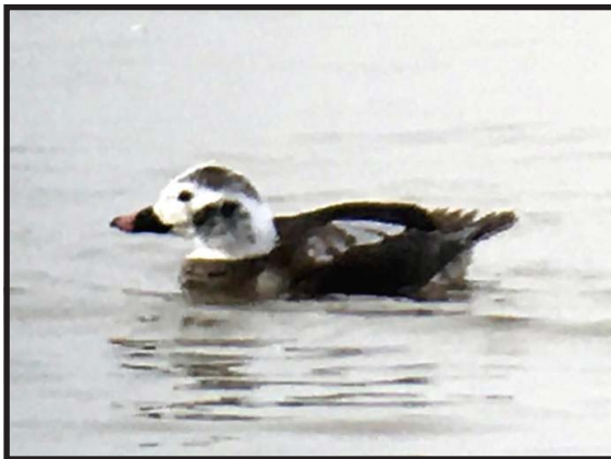
Photograph of Long-tailed Duck by David Patick.

Waterfowl numbers were strong for the third year in a row. The following species made appearances in at least ten West Virginia counties: Wood Ducks, Gadwalls, American Black Ducks, Mallards, Canvasbacks, Redheads, Ring-necked Ducks, Lesser Scaup, Buffleheads, Common Goldeneyes, and Hooded and Common Mergansers. Birders in at least seven counties each found American Wigeons, Greater Scaup, White-winged Scoters,