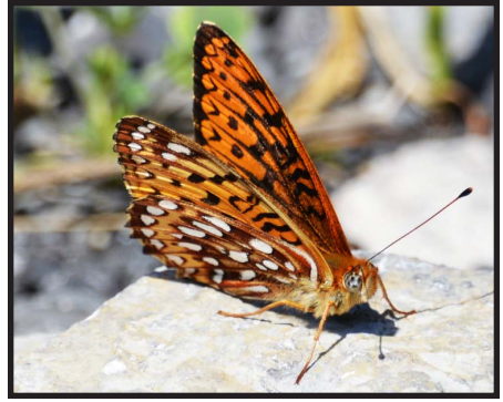
Great Spangled Fritillary