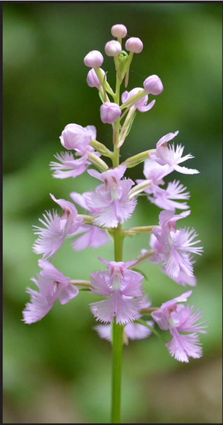
Large Purple Fringed Orchid