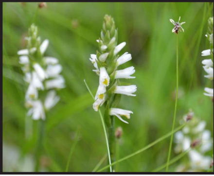
Shining Ladies' Tresses