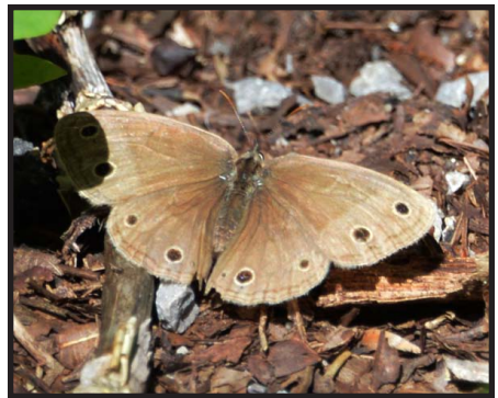
Wood Satyr on forest litter