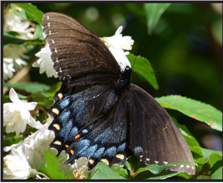
Spicebush Swallowtail deutzia or Fuzzy Pride-of-Rochester