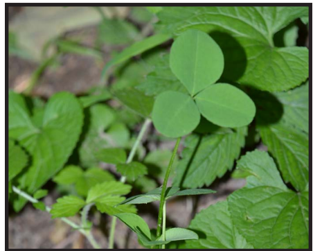
Running Buffalo Clover