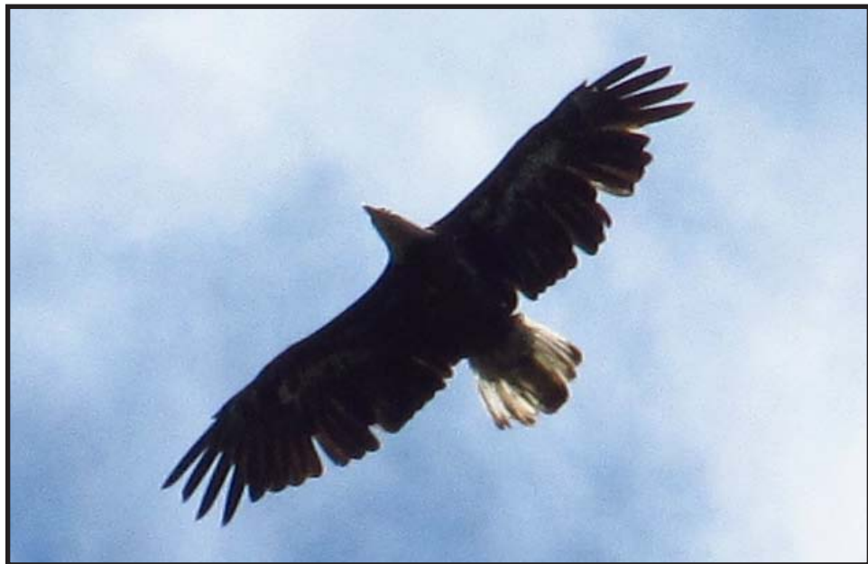
Bald Eagle flyover during the Cheat River canoe trip.

348 Station Street, Apt. 7 Bridgeville, PA 15017