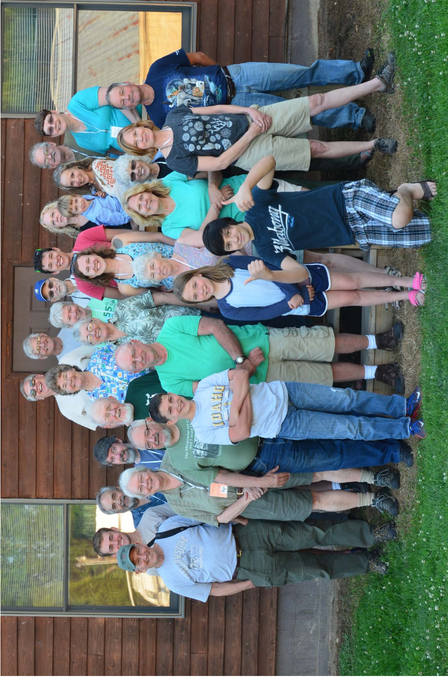
Foray Participants.