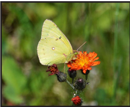
Sulphur on Orange Hawkweed