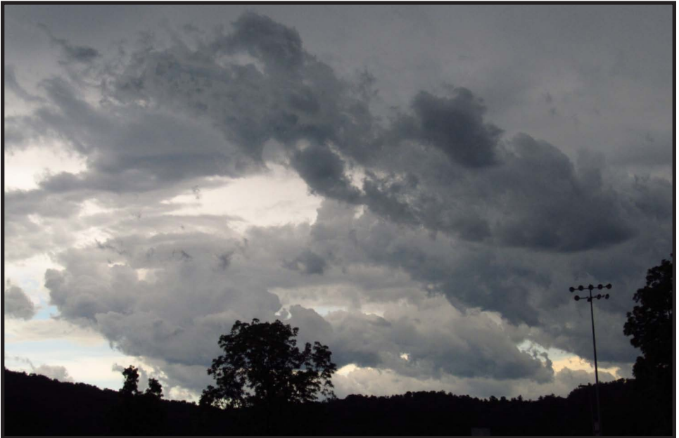
Clouds right after a strong thunderstorm passes through camp.