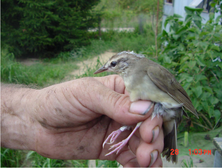
Figure 2. Swainson's Warbler captured at TRMO on August 28, 2012.