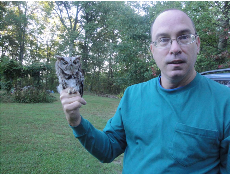
Figure 3. The author holding an Eastern Screech-Owl captured at TRMO on September 23, 2012.