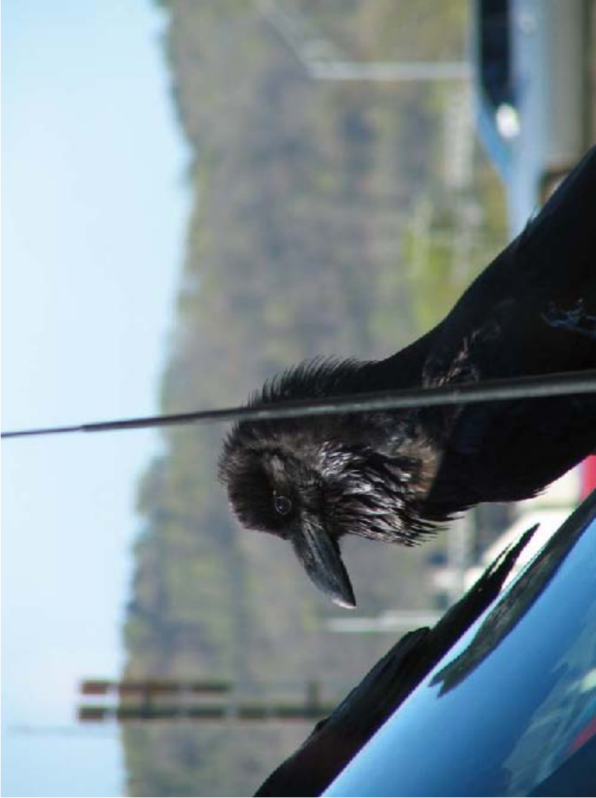
Figure 1 . Common Raven displaying in Putnam County.