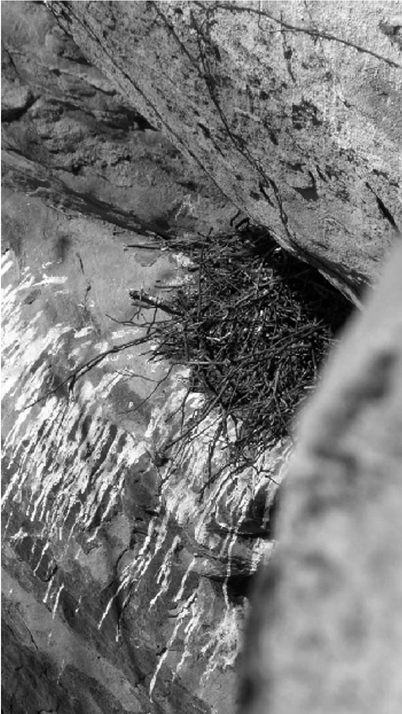
Figure 2. Common Raven nest at Redhouse Rock.