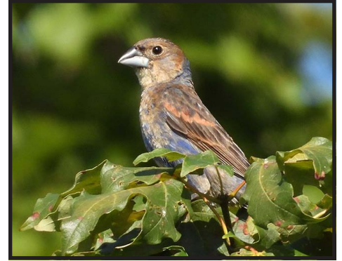
Blue Grosbeak, Greenbrier, WV

Hummingbirds have been a joy to watch. All three feeders are very busy as is the red salvia I have nearby. Tithonia, not a native I know, is another favorite of hummers, Monarchs and bumblebees. Part of the plant is in front of the window so I get a front row seat.