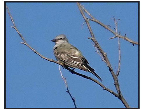
Western Flycatcher, Poor House Farm Park on 10/3/23