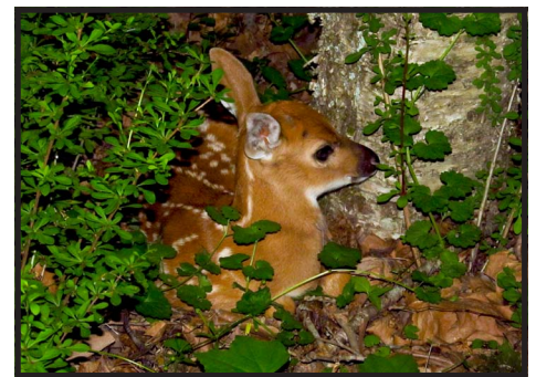
A fawn at camp. Many fawns were seen.