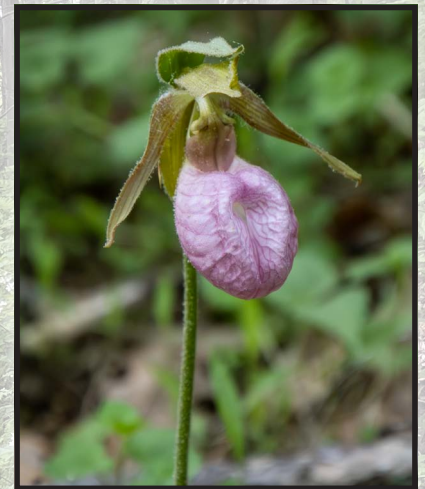
Pink Lady's Slippers were found around the county