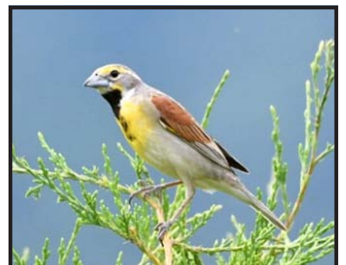
Dickcissel on Hogueland Lane, Grant County, WV