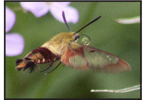
Hummingbird Clearwing Moth