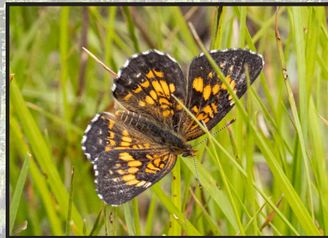
Harris' Checkerspot – Beall Tract

It was a cool and slightly overcast morning for the 6:30 AM bird walk. Tom Fox led the group down towards the open fields at the main camp then back up the path that followed the creek behind the campground. Dawn Fox spotted a small hanging, cup-like nest low in a small shrub along the path. It had two small white eggs inside, and soon an Indigo Bunting flew in to attend to the nest. As the group walked the path, a Louisiana Waterthrush seemed to escort them along the way. Two Parulas were also heard singing in opposition to one another.