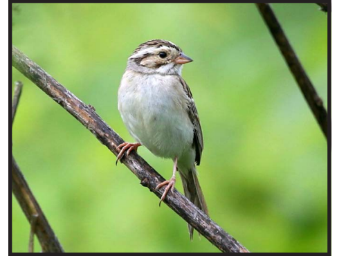
Clay-colored Sparrow