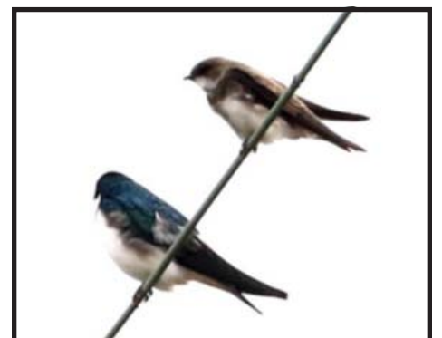
A very early Bank Swallow (top) with a Tree Swallow