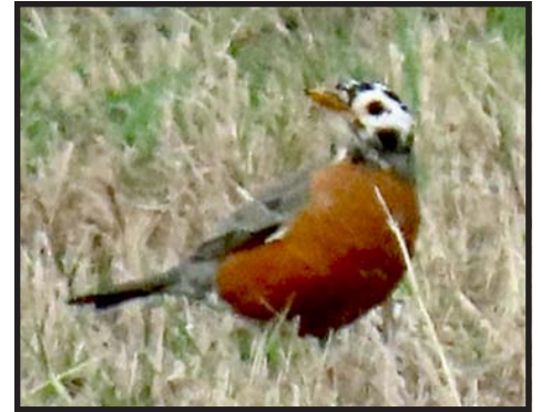
Leucistic American Robin