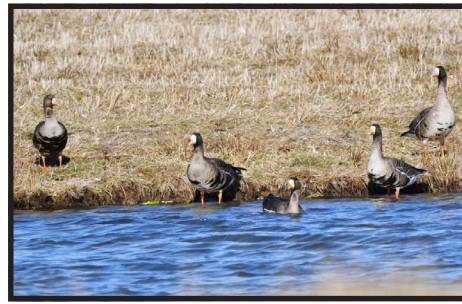
Greater White-fronted Geese at the JW Ruby Research Farm, Reedsville in Preston County