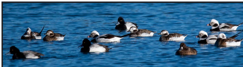
A raft of Long-tailed Ducks mixed with Lesser Scaup, Rehe WMA, Preston Co.

If I call Winfield locks "Prairie Warbler City", then Mammoth Preserve is "Prairie Metropolis" - gracious, there were PRWAs (15 total) about every two feet, loving the reclaimed mine. Plus two very handsome Grasshopper Sparrows not only singing, but singing up on little trees so we could study them. Several gorgeous Blue-winged Warblers and one gorgeous Scarlet Tanager. On the "heard but not seen" list - several chats, many White-eyed Vireos, and one