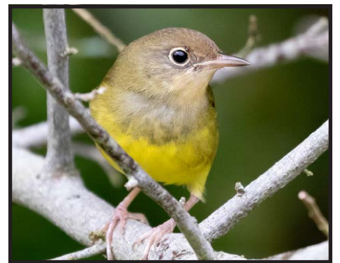
Connecticut Warbler - photo by Jim Triplett