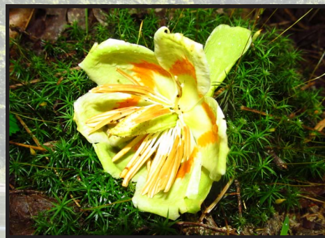
Yellow Poplar flower