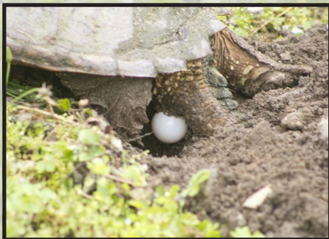
Snapping Turtle laying eggs by Terra Alta Lake

Carpools were quickly made after breakfast to head out to Cathedral State Park. If I've been to the park before I can't remember it, but I'd definitely recommend it. There is a little something for all nature lovers at Cathedral. For the birders 35+ species were either heard or seen. The trees, ferns, creeks, and natural beauty of the park is a site to behold. BBC members made their way through