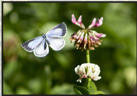
Summer Azure at Rebe WMA