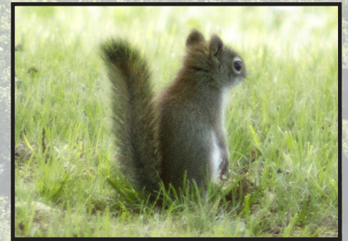
An adorable Red Squirrel at camp