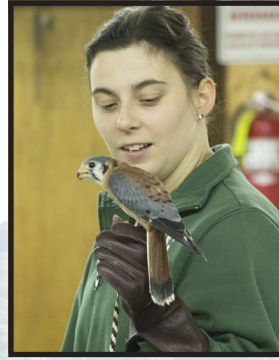
Male American Kestrel brought by the ACCA

Sunday was a full day of activities. The morning started off with a bird walk led by Janice Emrick along Camp Galilee Road. Following breakfast, thirty-six participants headed for Cranessville Swamp. It was a beautiful day as we headed into the swamp through the pine plantation. The Chestnut-sided warbler was the most prevalent bird of the trip. Seeing the common sundew carnivorous plants and the tamarack trees were a treat. After dinner, Katie Fallon of the Avian Conser-