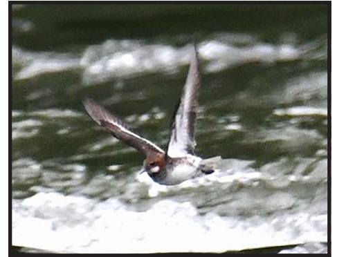
A rare Red-necked Phalarope at Valley Falls SP in May