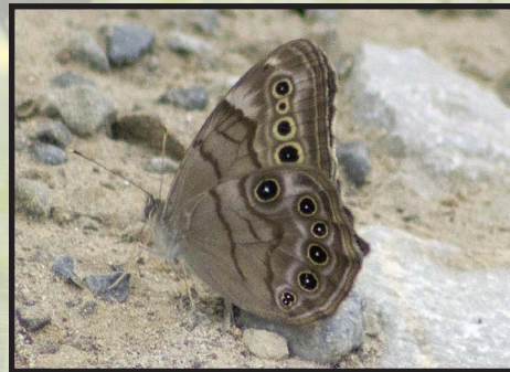
A Northern Pearly-Eye along Beech Run Rd.