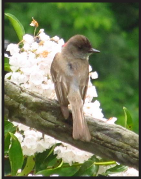
Phoebe - Old Hemlock

On arriving back at camp, several attendees discovered a large female snapping turtle laying eggs in a hole near the beach.