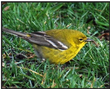
Pine Warbler

Also, I think I figured out why my birds don't seem to sing like elsewhere and the Wood Thrushes have abandoned the yard. I believe I have a Cooper Hawk's nest just outside the fence. I haven't seen them but I have heard the "cak-cak-cak" when a