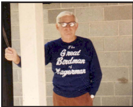
The Great Birdman of Hagerman