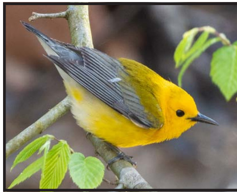
Prothonotary Warbler, Kanawha State Forest, April 22, 2022

gorging on black oil seeds. The rain was the perfect excuse to stay indoors and watch birds!