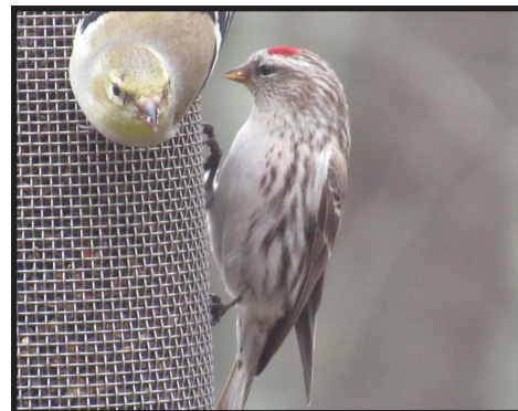
Common Redpoll found in Preston County, March 6, 2022