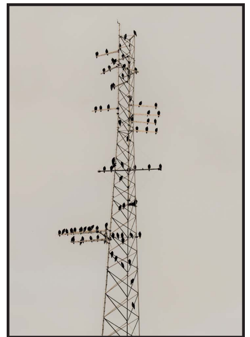
Vultures on tower