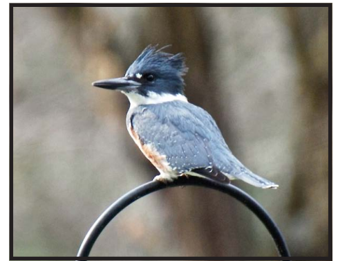
Belted Kingfisher on shepherds hook.