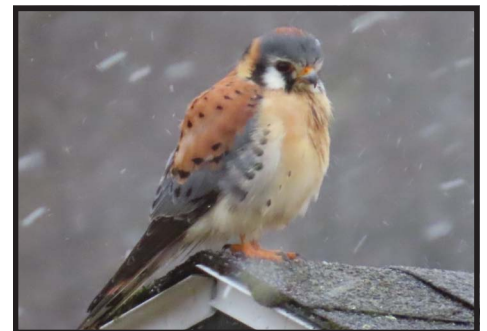
A lifer male kestrel in Frenchton, WV

The highlight of part two of our Christmas Bird Count was finding some male and female Evening Grosbeaks at someone's feeder. What a surprise that was! These folks had a number feeders and suet holders out but what I noticed was a group of spruce(?) trees coming from the house to the road, creating a windbreak for the yard. The trees lower branches reached the ground. In front of these trees were four ground platform feeders. Lots of activity