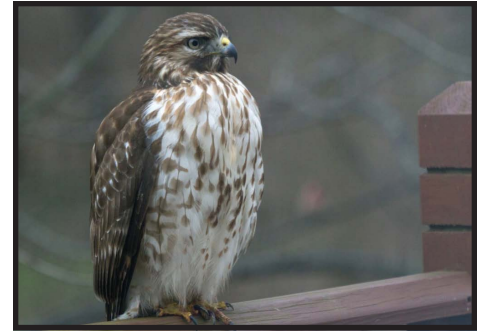
Juvie Red-shouldered Hawk on the deck