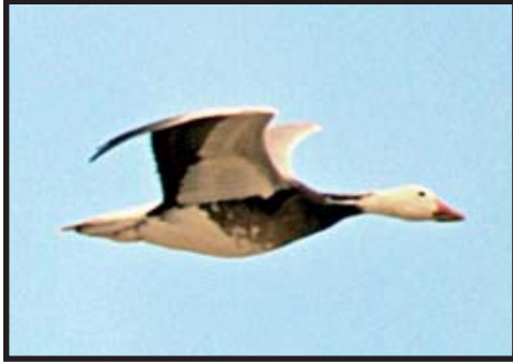
A surprise Snow Goose in traffic

with a variety of birds going from the feeders into the trees and back again. Such a perfect arrangement.