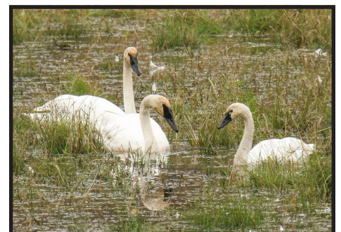
Trumpeter & Tundra Swans, Pleasant Creek WMA