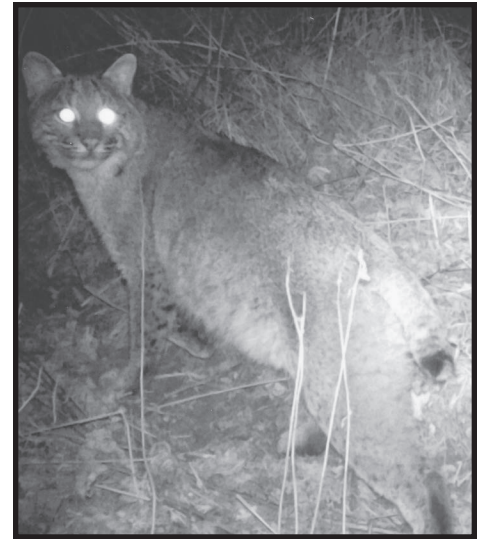
Bobcat in the dark