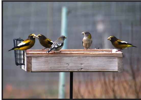
Evening Grosbeaks seen daily at Cairo feeders