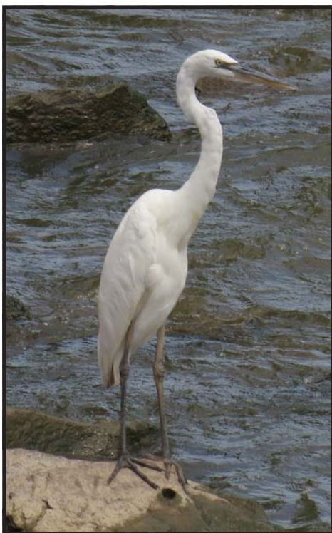
Great White Heron