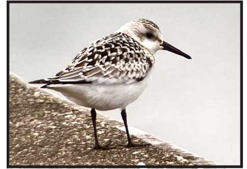
Sanderling at Harris Riverfront Park in Huntington, WV