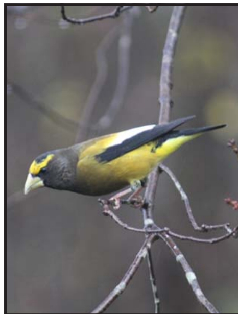
Lifer Evening Grosbeak at Bruceton Mills bird feeder