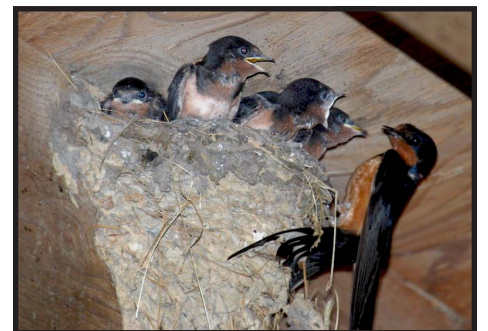
(top to bottom) Red-winged Blackbird, American Robin, Brown Thrasher and Barn Swallows