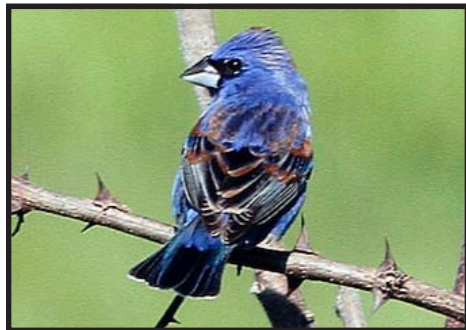
Blue Grosbeak at the USDA Fruit Research Station

This past weekend was spent mostly around our home working in the rose and perennial gardens, but Saturday evening my wife and I drove over to Mt. Zion Baptist Church to listen for the Chuck-wills-widow. Sure enough, around, 9:25 pm we heard one calling from the large pasture beyond the cemetery. As we were leaving the area, we stopped near the school and heard Whip-poor-wills calling from the woods across the street. Two nice night birds on a truly pleasant evening.