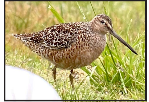
Long-billed Dowitcher at Beech Fork Marina

We had a beautiful morning to hike Seneca Rocks to do our monthly count there. We wished we hadn't done it on a Saturday as there were quite a few people there. However, this looked like the best day weather-wise in awhile. Before we left while putting seed in our feeder, I heard the first Chestnut-sided Warbler of the spring here in Harman.