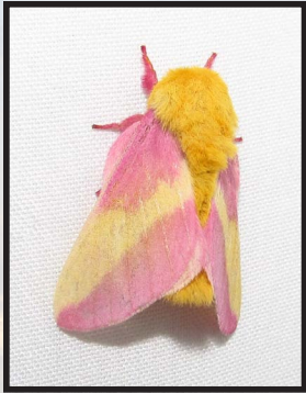
A beautiful Rosy Maple Moth

I spent the afternoon birding and (sort of) botanizing my way around the Cranesville region. A wrong turn at Albuquerque took me into a short birding excursion into Maryland, and after that it got warm, muting some of the bird song. Found a four-foot-long Black Rat Snake sunning in the middle of Lakeford Road. As I got out of the car in an attempt to photograph it, a "good 'ole boy" in a small pickup came flying up the road at top speed. I stood behind the snake to try to stop him from running it over, but he never slowed until I jumped out of the way. After greeting me, I told him I was trying to keep him from running over the snake. He sat silent for a moment, then said, "hope I got it!", and gunned it. Poor snake.