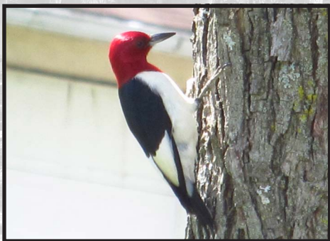
Red-headed Woodpecker near Arthurdale

I ran my last planned BBS route on Cadell Mountain today. A dozen warbler species was good, but eight Yellow-billed