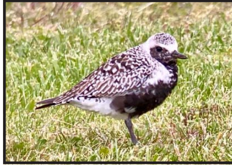
Black-bellied Plover at Beech Fork Marina