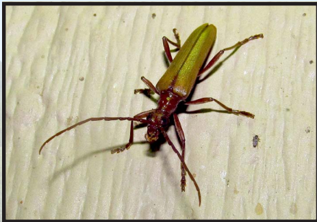
Staghorn Beetle species

First stop was at the county line at Cooper’s Rock’s offices. I’d had ideas on how I was going to collect my data, so this was an easy place to start. Birds started accumulating on my bird list, the plants I knew got IDed, and the ones I didn’t know (read: most of them) were photographed with a DSLR camera with a macro lens that is used, but new to me.