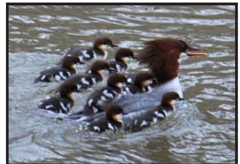
Female Common Merganser and crew

Our polar vortex during the last few days has been hard on the birds, especially the returners (I imagine the grosbeaks are pining for Colombia and Ecuador). Last Friday night it got down to 20 degrees here, and we had 2.8" of snow on Canaan Mountain. Sadly, it appears that a male Indigo Bunting who had been visiting the feeders every day succumbed to the cold (update: he appeared to have survived). All the other yard denizens seem to have survived, including a plucky Field Sparrow who is holding his or her own with the big guys at the feeders. Fingers are crossed that the House Wrens make it through to warmer weather. I've gone through sunflower seeds faster over the last five days than any time I can remember,