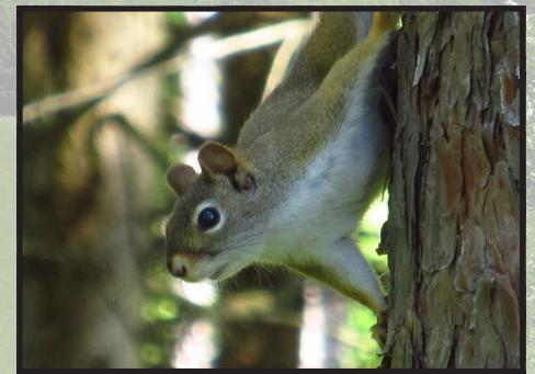
A Red Squirrel stalking me at Cranesville

I worked a few nice back roads on the way to the swamp, and there were three more Alder Flycatchers, lots of Swamp Sparrows and a Red-shouldered Hawk. At a barn in the hamlet of Cranesville, there was a small colony of Cliff Swallows.