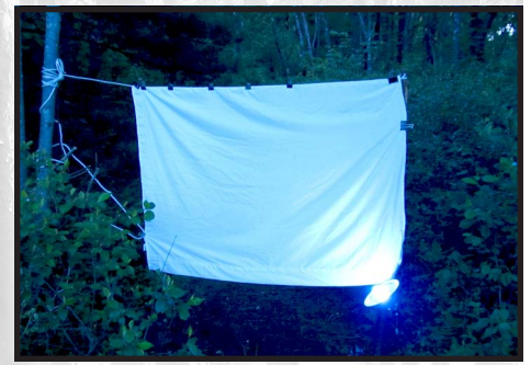
Moth sheet set up at Cranesville boardwalk

I worked my way down the Cheat River towards Rowlesburg this morning. I had hoped for hours of birding and botanizing, but neither were stellar. I did find a Carolina Chickadee in a neighborhood across the river from Rowlesburg. A promising road up a mountain ended 1/2 mile in with another epic washout, so I