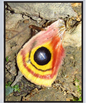
An Io Moth met an unfortunate end

that I'd seen a lot of, but hadn't IDed yet. A couple of Blackburnian Warblers and Yellow-throated Vireos sang. I finally got to see some of the giant hemlocks that the property is named for. It is a magical gully down off the road.