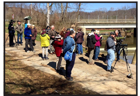
Everyone scanned for eagles at French Creek, but came up with 18 Wood Ducks