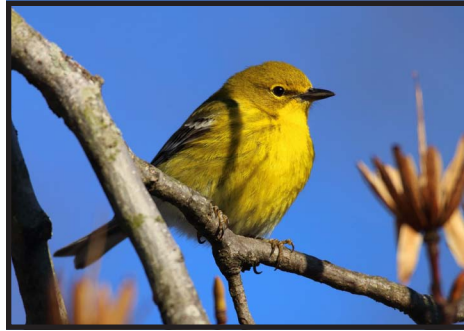
Pine Warblers sang around the park lodge and provided superb views

Willow Island Dam added Rusty Blackbird and a number of cormorants on the riverside light posts. French Creek was highlighted by many Wood Ducks and a Common Merganser. At Middle Island, we had five Horned Grebes on the river, a