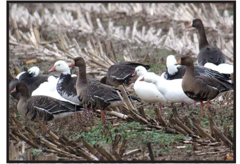
Nice mixed flock of geese on Rt. 817 in Mason Co.