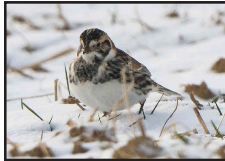
Jefferson County Lapland Longspur