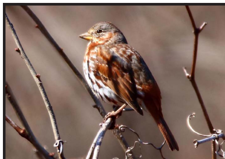
A Fox Sparrow made a quick appearance on Middle Island after lunch