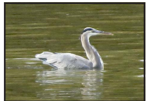
The oddity of a swimming Great Blue Heron