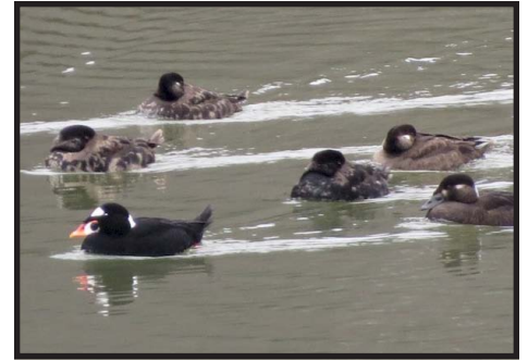
December Surf Scoters in Belle, WV

Our sojourn into the freezing weather wasn't bad either. Among the highlights was at least 45 Bald Eagles, 3 Golden Eagles, a raft of 45 plus Mallards, Great Blue Heron, a big