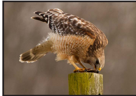
A Red-shouldered Hawk dispatches a turtle. A turtle in February? On Valentine's Day?