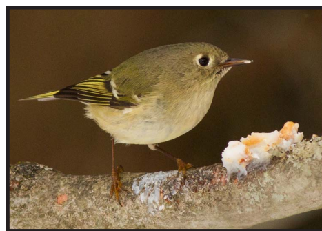
A Ruby-crowned Kinglet feeds on suet.

Through 1/30, our oriole has appeared every day since late November! Always first in the morning and off and on throughout any day I have to watch. Additionally, I have had a ruby crowned kinglet since sometime in early December too.