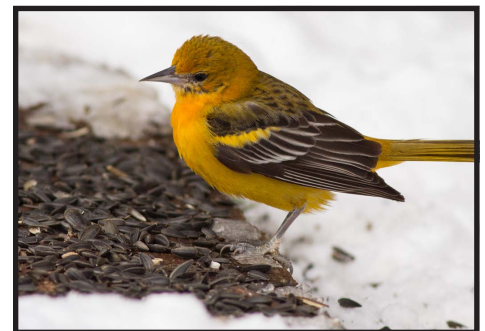
A Baltimore Oriole on the wrong side of the calendar