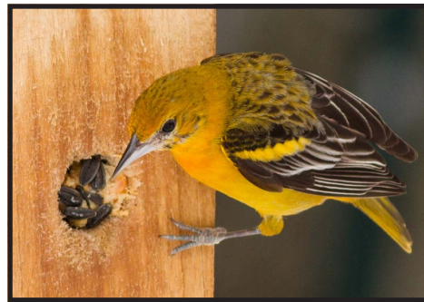
A Baltimore Oriole eating peanut butter and black sunflower seeds.