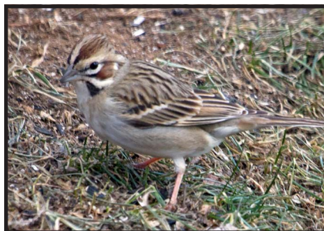
A wonderful winter visitor, a Lark Sparrow