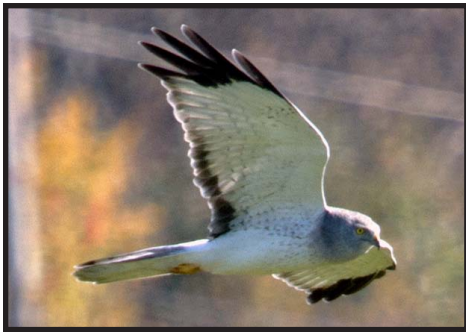
A beautiful gray ghost

– N. Wade Snyder, Shenandoah Junction, WV, 11/03/15