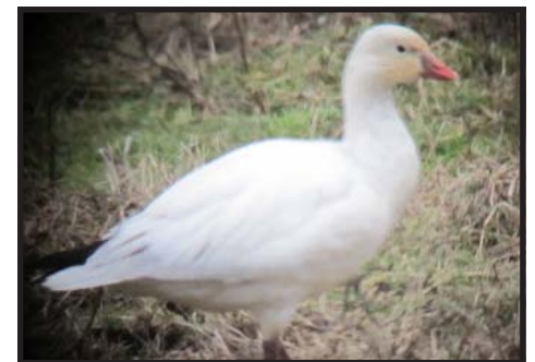
Ross's/Snow Goose Hybrid