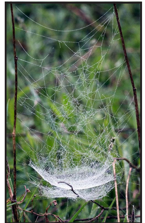
Doily spiderweb at Opossum Creek Retreat meadow