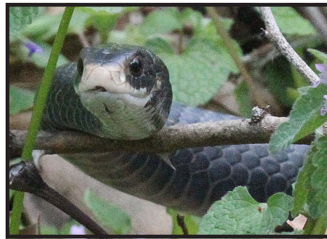
Black Racer