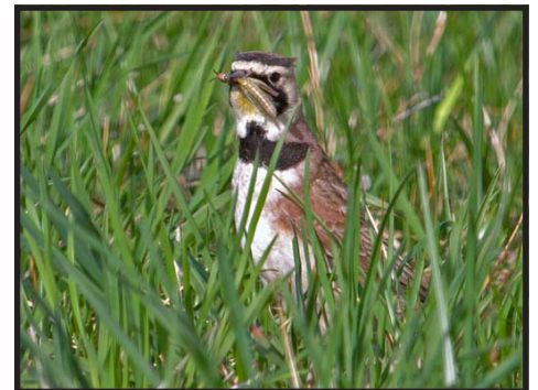
Horned Lark with food

We sat at the mouth of the Bluestone River, Summers County this evening and saw 8 immature & 5 adult Bald Eagles. Also had 40 Common Mergansers, 12 Hooded Mergansers,