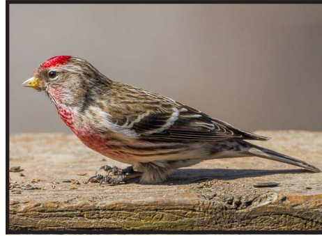
A rare Common Redpoll for his area

Took maybe an hour this afternoon and relaxed the old-fashioned way: lying back on blanket on backyard grass with baby. My view bordered by privet hedge, bare linden tree branches and the budding chartreuse leaves of Norway maple. The canvas a moving mixture of puffy