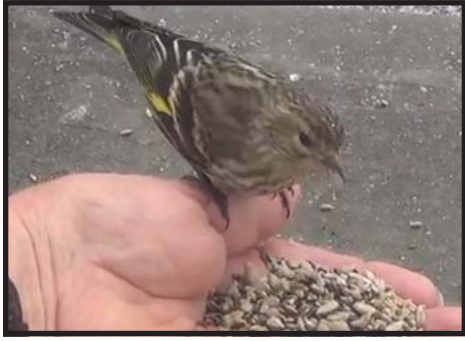
A siskin in the hand...