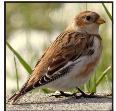
Snow Bunting in Jefferson, Co.