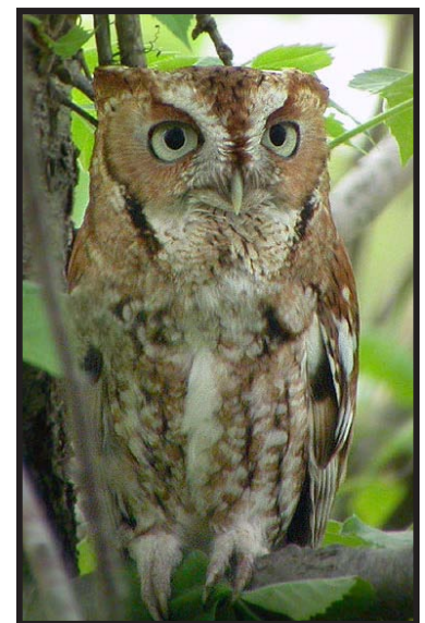
Eastern Screech-Owl in Jefferson, Co.

– BIRDMOM and Owl Dad Jefferson County, WV