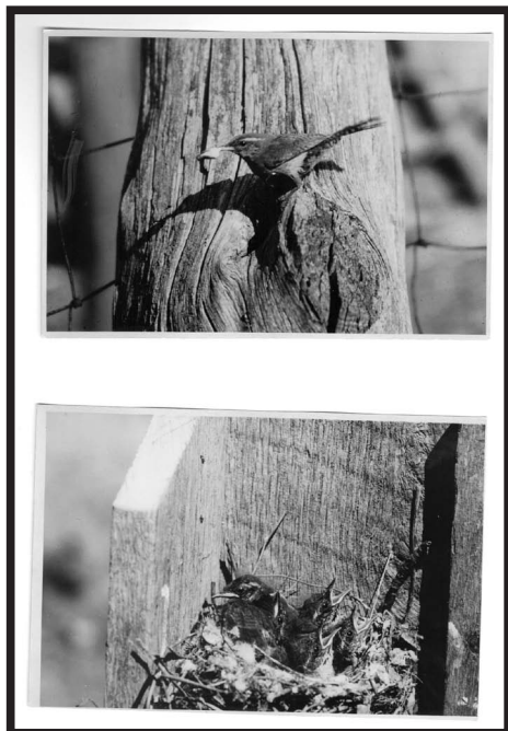
Bewick's Wren and nest