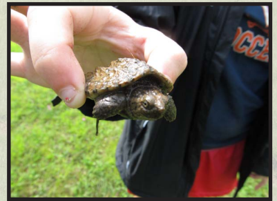
Baby snapping turtle at camp