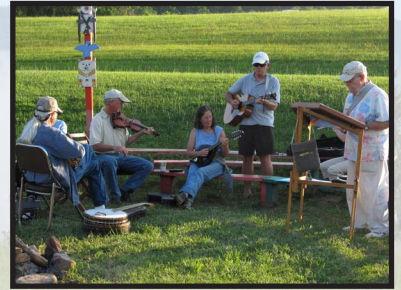
The Potluck Jug Band playing for us at campfire