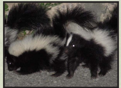
What Ryan and Orion found while cruising the streets of Elkins one night