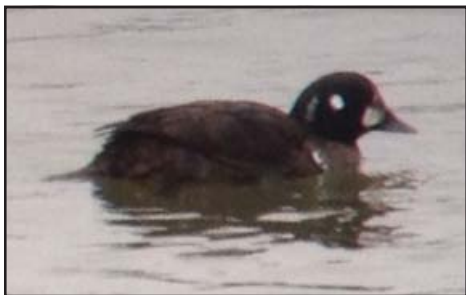
Harlequin Duck near Parkersburg