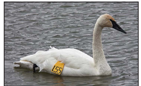
Trumpeter Swan while at Cheat Lake