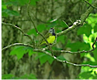
Mourning Warbler

Saturday evening – Birding Essentials for Everyone – Birding is one of those special activities that can be enjoyed by anyone at any skill level. Whether you are an experienced birder or a beginner, this entertaining class will help you expand and improve your birding abilities. We will explore appearance, behavior, location, sound, equipment, and other topics. These insights and techniques will help anyone expand their birding skills and enjoyment.