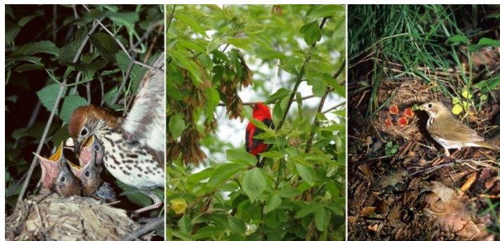
Left to right – Wood Thrush, Scarlet Tanager, and Ovenbird

Sunday field trip – Canaan Valley State Park – We will walk the Blackwater River Trail watching and listening for birds. Depending on the weather, this trail can be quite birdy. We should be able to see and/or hear a nice variety of birds: woodpeckers, warblers, flycatchers, thrushes, vireos, and more. If time permits, we may explore parts of the Promised Land Trail.