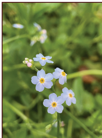
Davis Creek Forget-Me-Not

SATURDAY, APRIL 1: LEARN ABOUT NATIVE SPRING AMPHIBIANS, a presentation set for 1:00 at the Claudia L. Workman Wildlife Education Center, 301 Forks of Coal Way, Alum Creek, WV